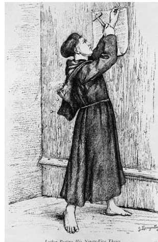
Luther Nailing His Ninety-Five Theses